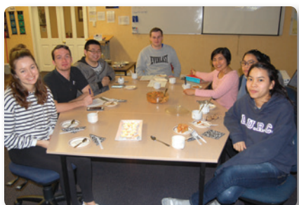
Students in the Christian Worship Class