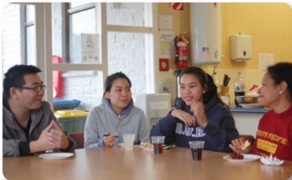
Three cultures in fellowship together